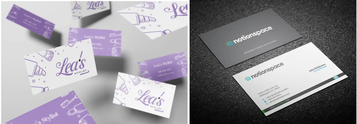
Figure 1: Business cards created on Freelancer.com

With corporate and networking events back in action, so are business cards. In Q3 2022, Business Card design spiked by almost one third (30%) from 1,861 to 2,427 jobs. This is the first time since the start of 2020 that projects for Business Cards have grown significantly.